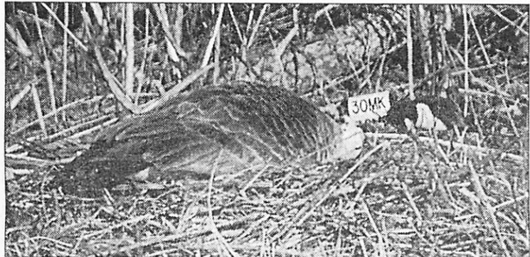
The female goose has a tagging device that may prove she came from as far as the Kuril Islands off the coast of Russia.